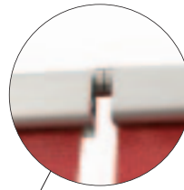
Expands patenterade magnetlösning